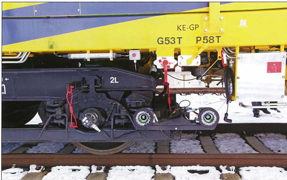
Figure 2: The stereo laser scanners fitted to the EM100VT.

achieved. The design of the fixed point target has been decided and the digital video stereo camera is successfully recording lateral dimensions at 150 frames per second. The means by which the track geometry is recorded by the bogie is proven. The relationship between this recorded geometry and the dimension to the fixed point is synchronised by a digital clock. By comparing the results of each test with the pre-recorded EM-SAT survey, the success of the project can be measured. It is hoped to declare the production accuracy of the measuring system in early 2019.